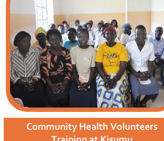
Training at Kisumu

If you live in rural Kenya and get ill, Community Health Volunteers (CHVs) may be your first source of help. The eyes and ears of the government community health centres, many will have had a relative die from cancer or are survivors of illness themselves. Each covers a home patch of about 100-150 households, close to where they live. As volunteers, they often run a business alongside this important work. Concerning cases are referred to the health centre nurse, and they meet monthly for mentoring. Some have had training in cancer and palliative care, and all are hungry for more and longer sessions.