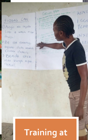
Training at Viengco