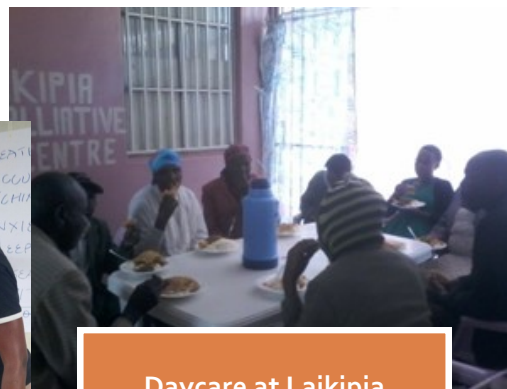
Daycare at Laikipia