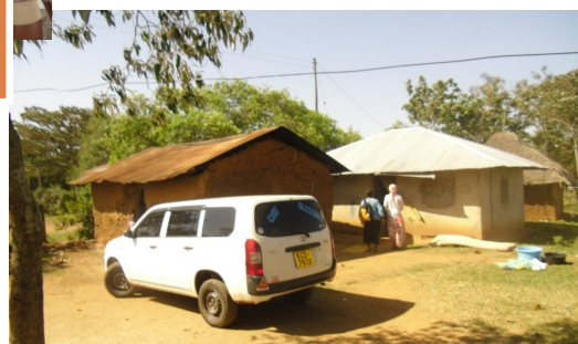
Home Visit from Busia