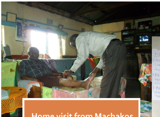
Home visit from Machakos