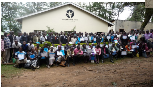
Community Health Volunteers Eldoret