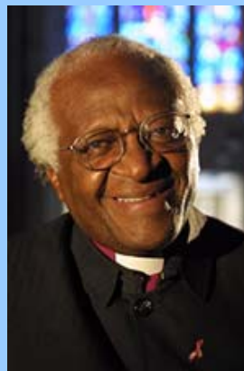
Archbishop Tutu

The following quotation from HCK's patron, Archbishop Desmond Tutu, is taken from messages of support on the Help the Hospices website for World Hospice and Palliative Care Day ( www.worldday.org ), which this year will take place on 11 October and be devoted to the theme: 'Hospice and Palliative Care: a Human Right':